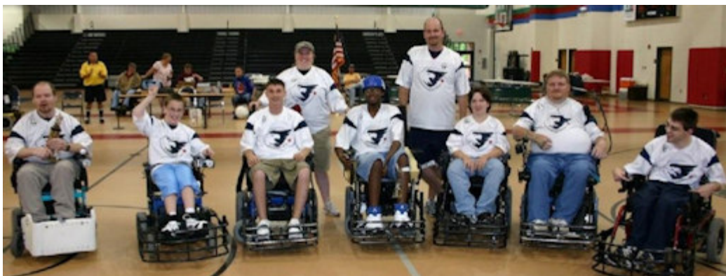
NORTH GEORGIA SCREAMIN' EAGLES Champions of the Southeastern League Championship 2009 in Carrollton.

The Screamin' Eagles finished 5th in the USPSA National Tournament. Congratulations! The Eagles are looking forward to defending it's title as the Champions of the Southeastern